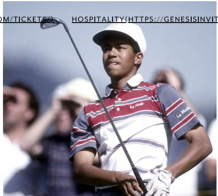
Pictured: Tiger Woods in his PGA TOUR debut in 1992